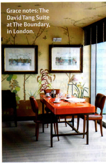
Grace notes: The David Tang Suite at The Boundary, in London.