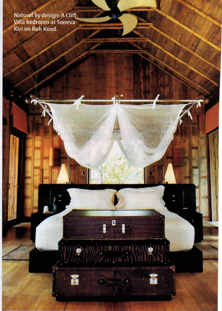
Natural by design: A Cliff Villa bedroom at Soneva Kiri on Koh Kood.