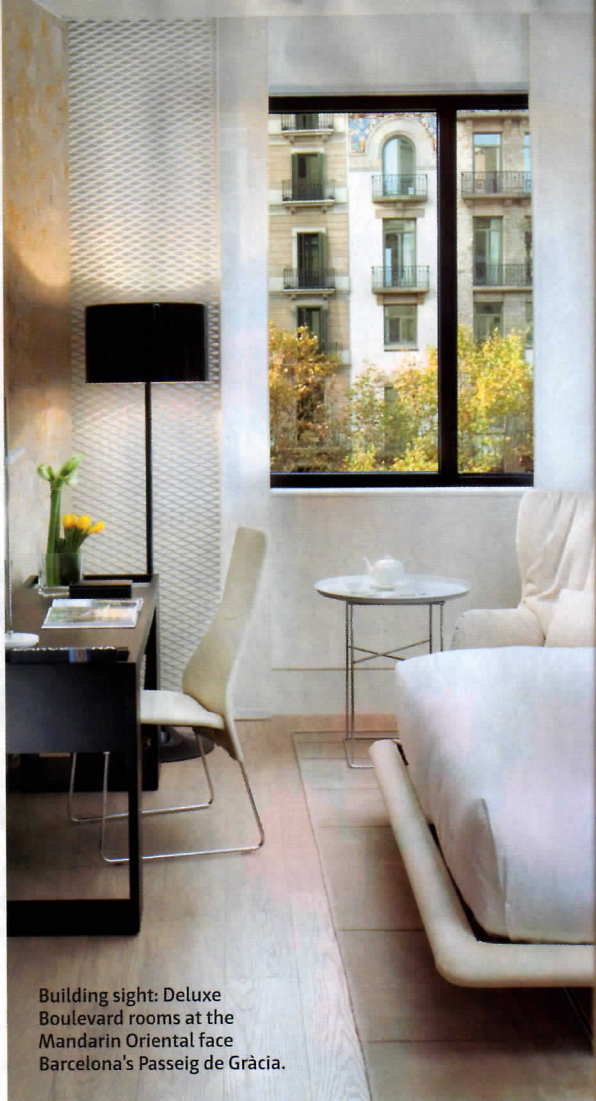
Building sight: Deluxe Boulevard rooms at the Mandarin Oriental face Barcelona's Passeig de Gràcia.

Transforming a military barracks into a luxury hotel isn't an easy task, particularly when the building, dating from 1699, is so historic that structural changes are forbidden. Fortunately, the design firm of Claesson Koivisto Rune overcame the obstacles, producing a triumph of Swedish style—a modest, minimalist, yet supremely comfortable property housed in two low, long buildings. The sense of antiquity is preserved (stone staircases worn smooth by the centuries, wooden shutters in the bedrooms), but there's no shortage of modern amenities, from the amazing Duxiana beds to bathrooms with rain showers. The hotel takes its name from the island it sits on: Skeppsholmen is an easy walk to the National Museum, NK department store, and high-end shopping in Östermalm. It's an even easier ferry ride from the Old Town, visible across the water. By day, lots of people cross the bridge to visit the hotel's neighbor, the Moderna Museet, but at night the island is virtually soundless. As a result the hotel is perfect for those who want quick access to the best of the city followed by undisturbed sleep. WHICH ROOM TO BOOK: To take full advantage of its location near the waterfront, get a seaweave room (46-8-407-23-00; doubles, $257-$280). 🍷 🍴 🛏 🚿 🌿