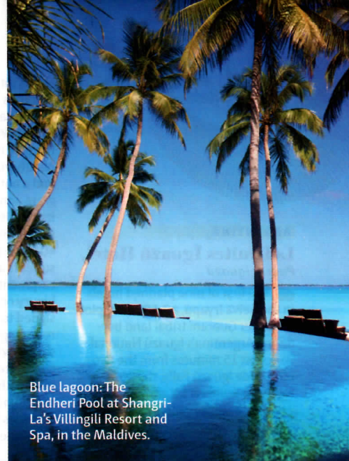
Blue lagoon: The Endheri Pool at Shangri-La's Villingili Resort and Spa, in the Maldives.

JW Marriott Resort, Khao Lak Soneva Kiri, Koh Kood