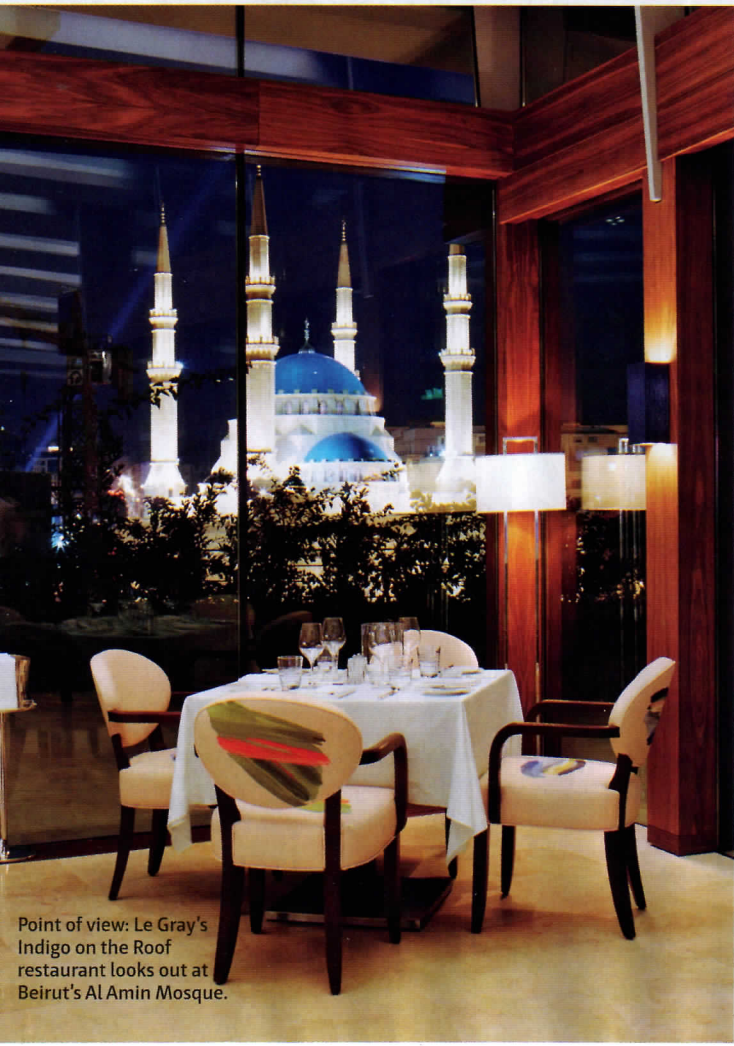
Point of view: Le Gray's Indigo on the Roof restaurant looks out at Beirut's Al Amin Mosque.